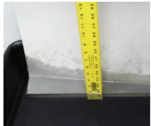
This is the same piece of drywall in the same wallpaper wetting trough; note the date of September 21.